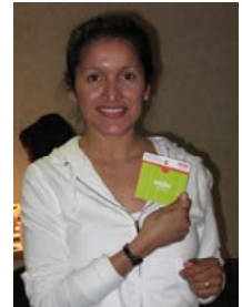
Fabulous door prizes will be given away

Please be sure to RSVP by May 1, 2009 to reserve your spot!