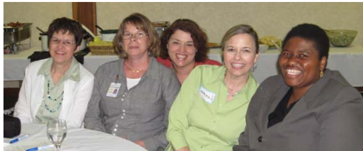
A group picture from Nurse and HHA Appreciation Day 2008

Vendors will be sure to pamper you on your appreciation day.