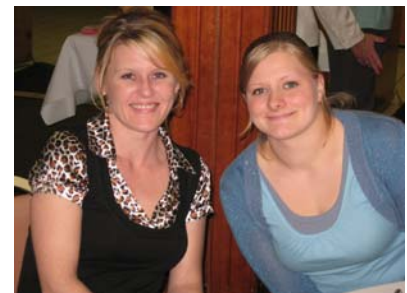
Our Staffing Coordinators enjoying the festivities.